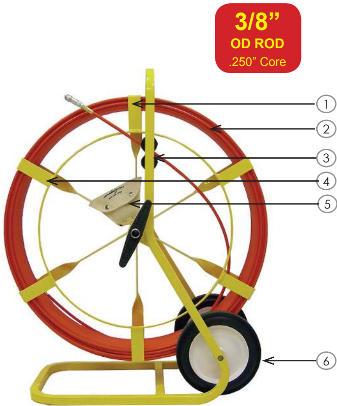
Dimensions: 39"H x 32"L x 18"W