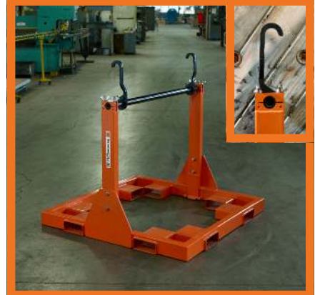
Lifting points for handling with a crane