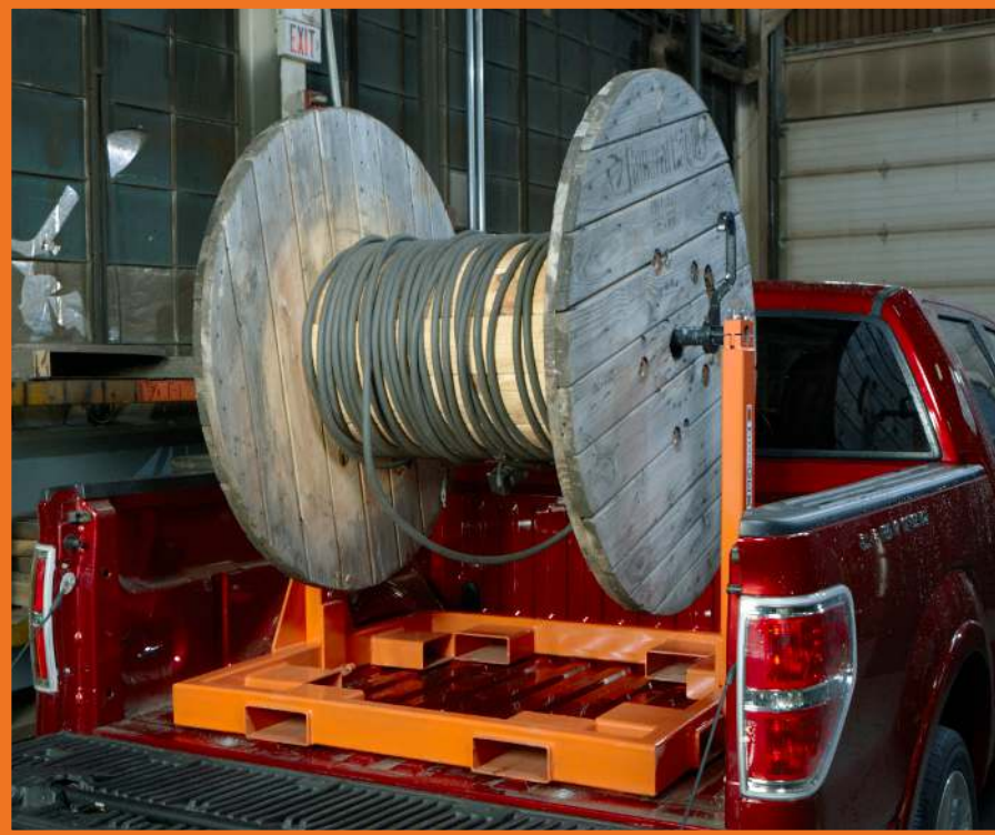
Can easily be loaded onto a pick-up truck or trailer