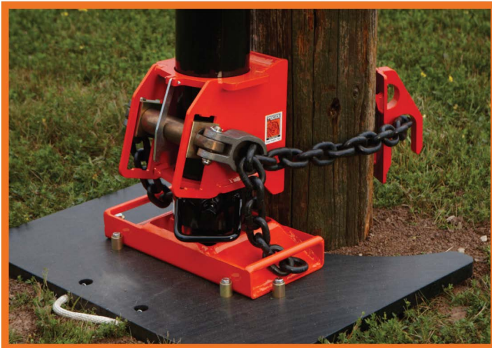
Swivel assembly pre-tensions the chain providing maximum lift per stroke.