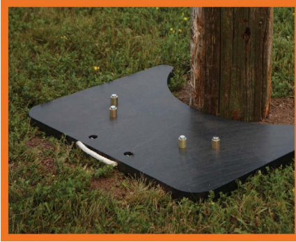
Engineered with the strength to take the full force of the pole pulling, and the flexibility not to crack