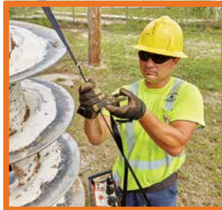
Tighten each ratchet strap to secure the auger