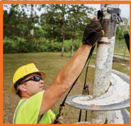
Attached ratchet straps to the ring clip collar on the auger