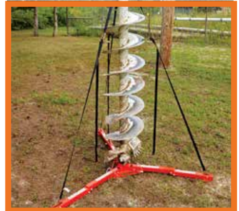
Fully secured auger