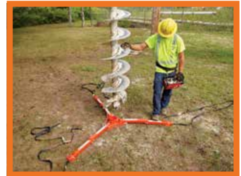
Swing Auger into position and place the tip into the center-receiving cup