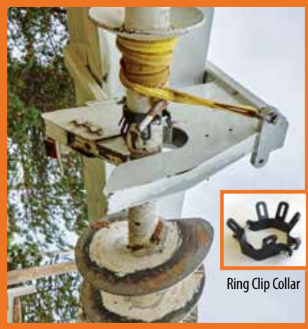
Attach ring clip collar to auger (included with Auger-Up)