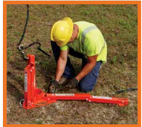
Reinsert locking pin to insure arms remain properly positioned