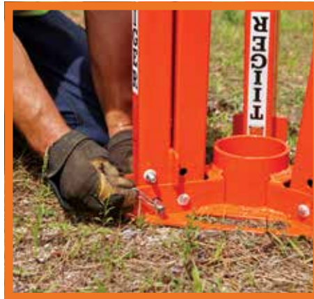
Position auger stand, remove locking pin and extend arms