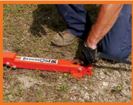
Attach ratchet straps to each extended arm